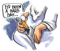
PRAYER - A CONVERSATION BETWEEN FRIENDS